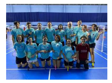
Broker Badminton Championship 2020

To provide our employees with a high quality of life, healthy lifestyle and fulfilling careers, Employees are encouraged to take part of any course of education to support their duty. Besides, the company promotes physical activities and sports among the employee. Sports can also use as a tool for healthy development and social development.