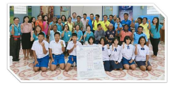
Ruammitr Wittaya School, Buriram Province.