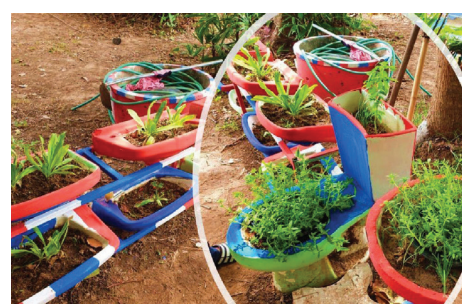
Agriculture activities to develop a career and income.