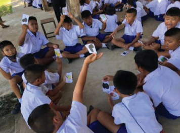
Active Learning Activities Program